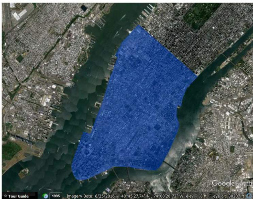
Figure 2. This analysis focuses on business interruption losses in buildings south of 42nd Street in New York City.

We focused our analysis on buildings south of 42nd Street in New York City (see Figure 2). Statistics for these buildings were gathered from data.ny.gov, which provides values for street address, building width and depth, market value, building class, number of stories in building, and detailed zone description (building use type) [45]. The data was obtained from the Condensed Assessed Value Roll created 2 September 2011. A manual scrubbing of the data was performed to account for multiple tenants residing within the same address. ArcMap from ArcGIS developed by Esri (Redlands, CA, USA) was used to geocode each property parcel. Property assessment data was acquired from the New York City Department of Finance 2010 census. As data was defined by building owner in the dataset, market values were summarized by building address to assess the complete value of each building. Building size was estimated using the data provided by the Department of Finance in building width and depth to compute area, and number of stories to calculate height and volume of the building [46].